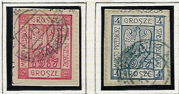
2 gr red.