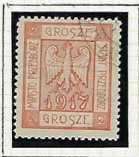
2 gr perforate proof in orange.

Used! Postmark is correct & genuine (possibly C.T.O.)