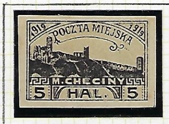
12h: blackish & sandstone