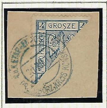
4 gr blue: halved.

Due to shortages the 4gr stamp had been used diagonally halved: