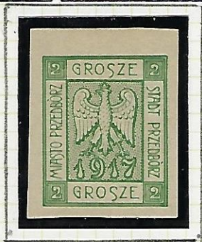
2 gr proof in green Imperforate (MLH)