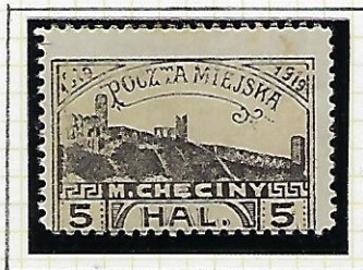
5h: deep black-sandstone & sandstone