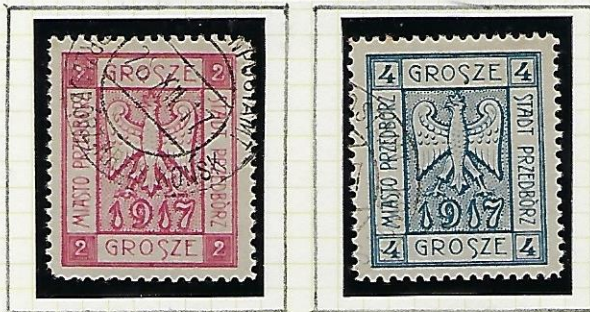
2 gr red. λ