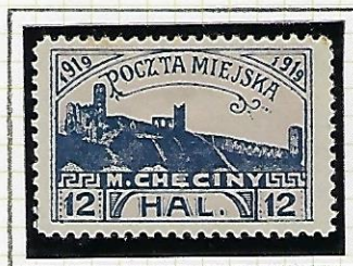
12h: blackish & sandstone.