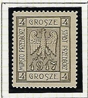
4 gr proof im olive (dark) (MLH).