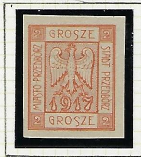
2 gr proof in orange Imperforate (MLH).