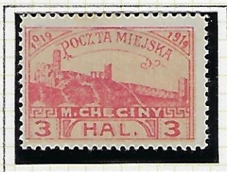
3h: orange and yellowish