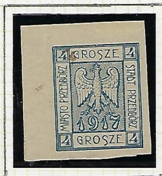
4 gr blue, imperforate (MUH).

Expertised by Schmutz & Perzyński (reverse)