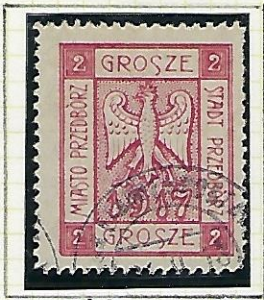
Possibly genuine. X

Line Perf. 11½ . Size: 23 x 28½ Paper: medium, white.